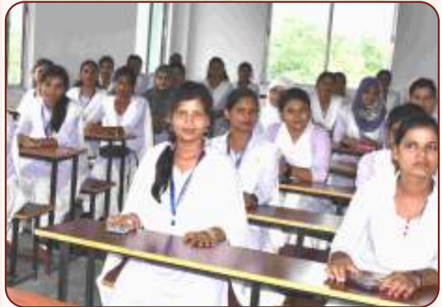
A view of Classroom