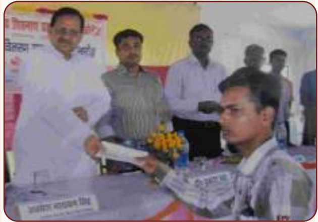
Hon'ble Chairman of Bihar Legislative Council distributing Scholarship