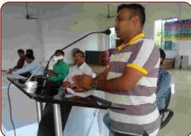
Secretary, Principal, Forest Officer & Staff during Ganga Plantation Camp