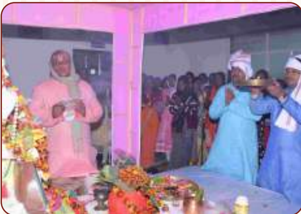
Secretary, Principal, Staff & Students during Sarasvati Puja