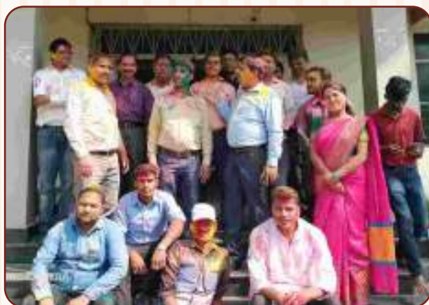
Principal, Staffs & Students during Holi Milan Samaroh