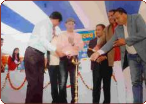
Inaugurating the Mega Health Awareness Camp by DM, Aurangabad, Secretary, & others respective person