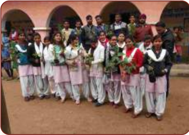
Plantation by Students in Middle School during Internship