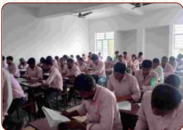
A View of Sent-up Exam.-2017