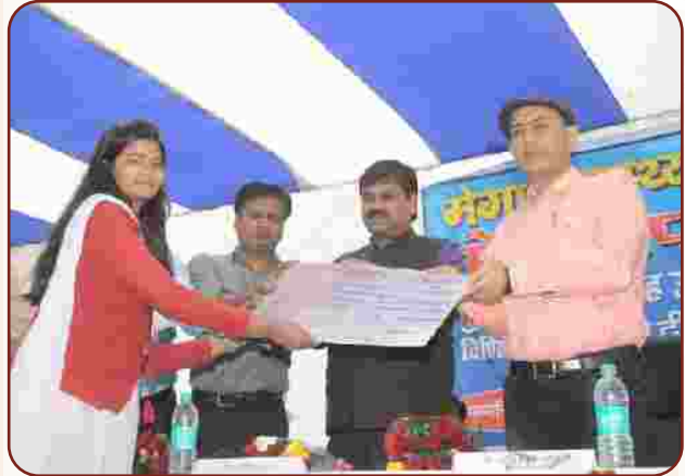
DM, Aurangabad, SDM Daudnagar & other giving a prize to the Students