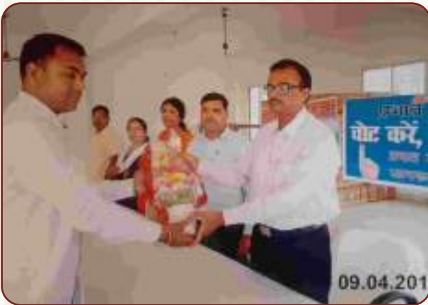
A View of Voter Awareness Programme