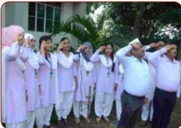
Flag Hosting Ceremony on Independence Day