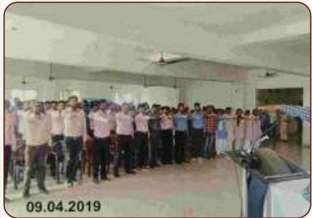
A View of Taking Oath by Students in Voter Awareness Programme