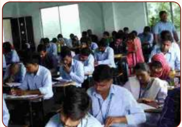
A View of Sent-up Exam.-2021