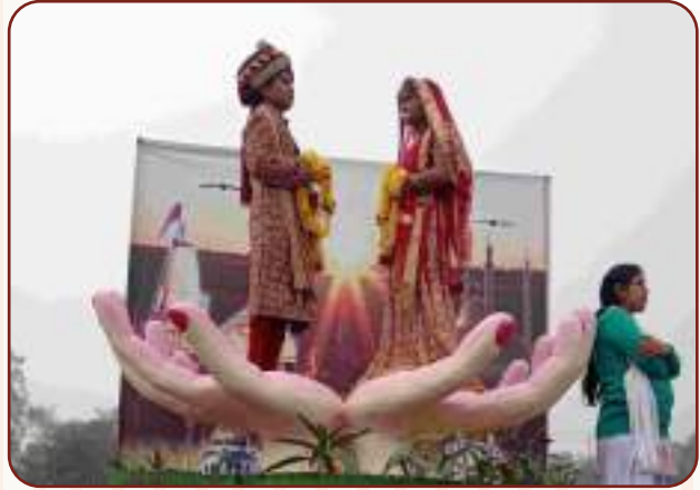
A View of Jhanki on the theme of "Dahej Pratha"-2019