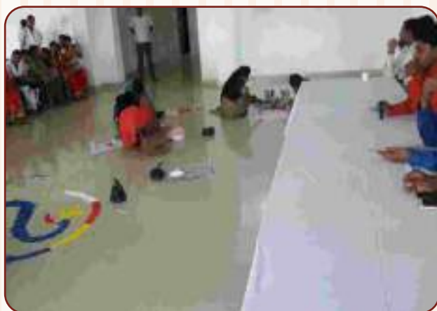
A View of Children's Day Celebration