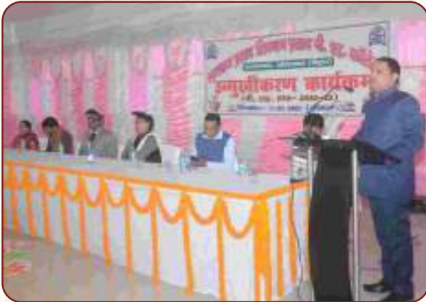
College Trust Member, Lecturer, Principal DN College Daudnagar, SDM Daudnagar, Lecturer DIET, Bhojpur & College Principal during Orientation Programme