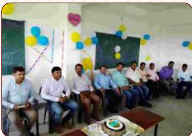
A View of Teacher's Day Celebration