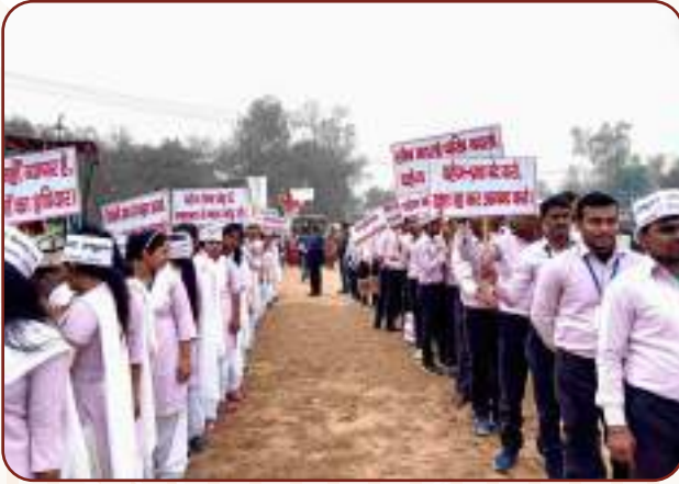
A View of Jhanki on the theme of "Dahej Pratha"-2019