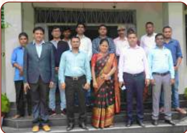
A View of College Staff