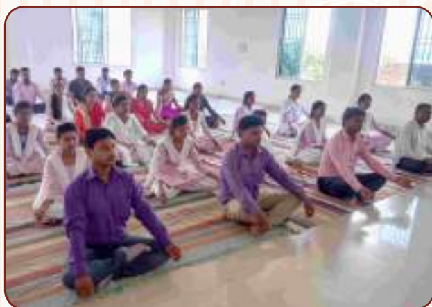
A View of Yoga Day