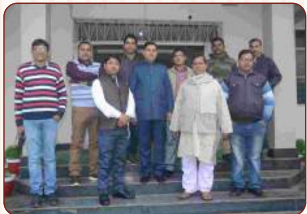
A View of College Staff with Other