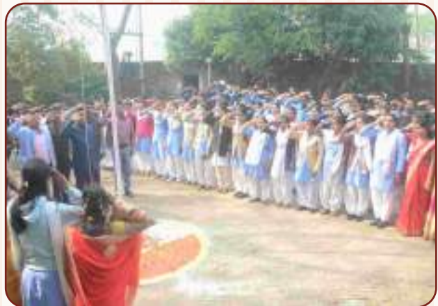
Flag Hosting Ceremony on Republic Day