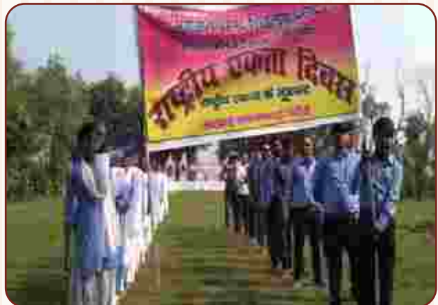
Awareness Programme on the occasion of Sardar Vallabhbhai Patel Jayanti