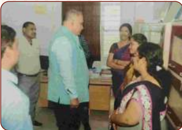
The Inspecting Team of Magadh University, Bodh-Gaya with College Staffs