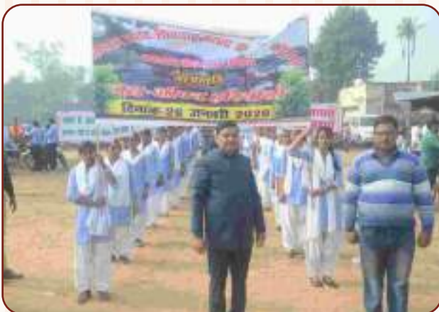
A View of Jhanki on the theme of "Jal-Jeevan-Hariyali"-2020