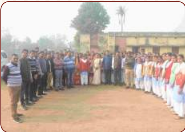
Principal, Staffs & Students during Jhanki