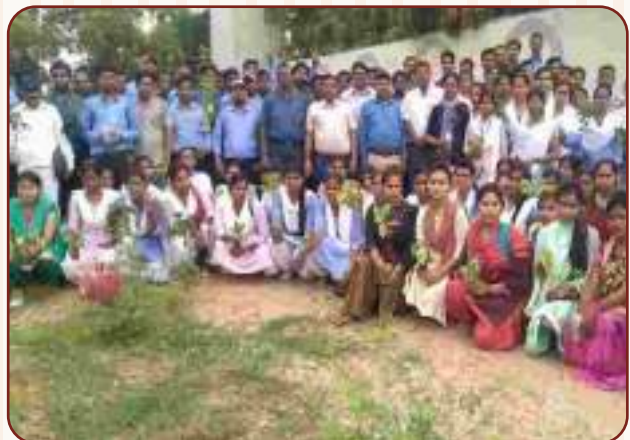
A View of Ganga Plantation Campaign