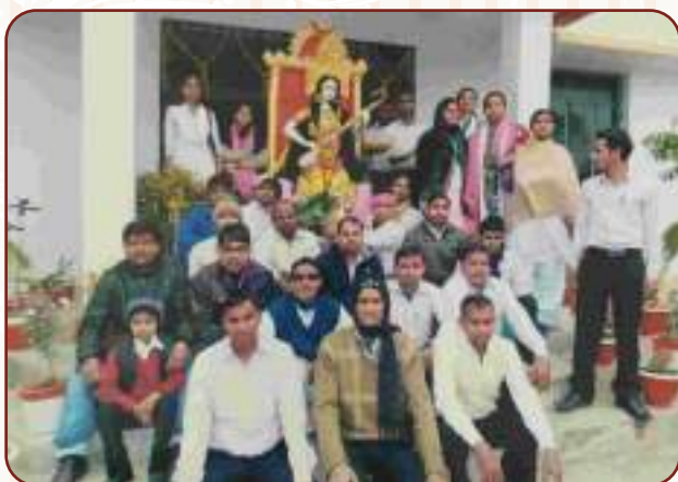
A View of Sarasvati Puja