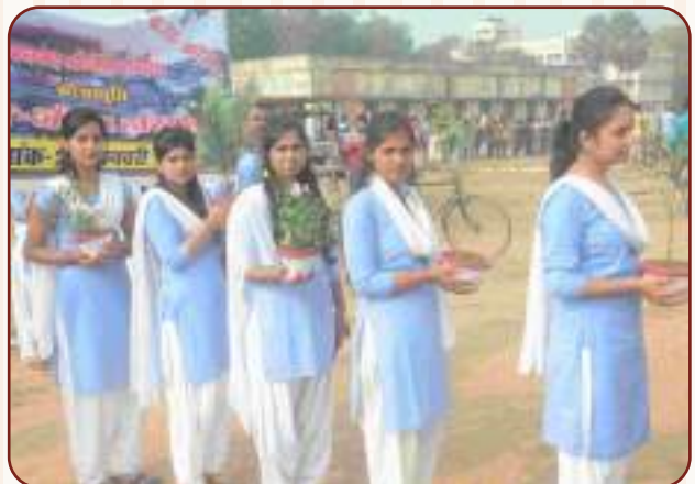
A View of Jhanki on the theme of "Jal-Jeevan-Hariyali"-2020