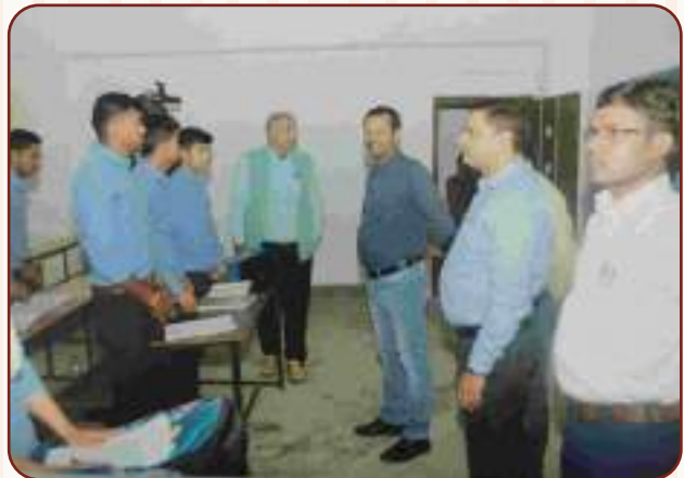
The Inspecting Team of Magadh University, Bodh-Gaya with Principal, Staff & Students